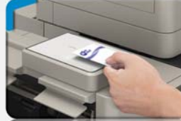
Contactless Card Reader