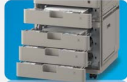
Easy Paper Access