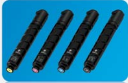
Simple Toner Replacement